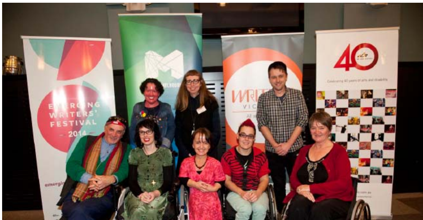
Write-ability Salon at the Emerging Writers' Festival.