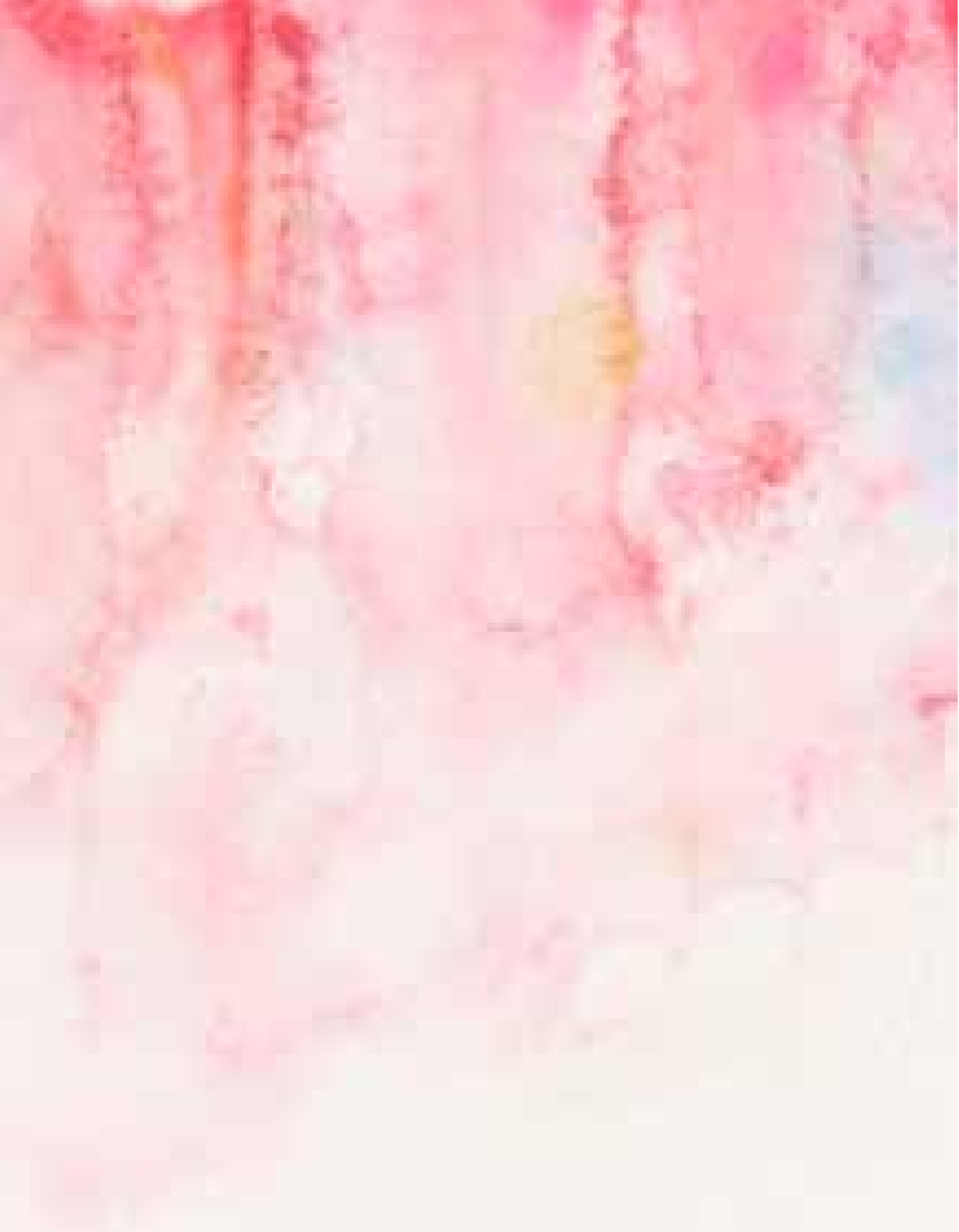
Front cover image from June 2013 'Victorian Writer' cover. Artist Carmel Seymour. Internal graphics by Toby Gibson.